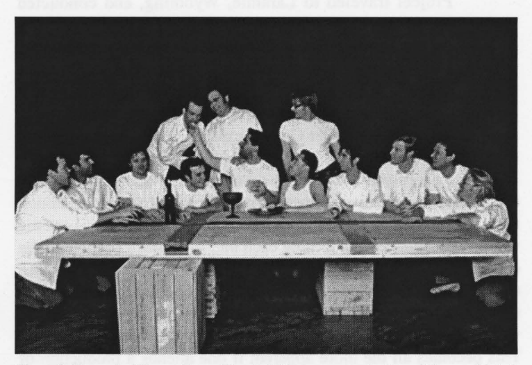
Figure 2: The cast of Hoarse Raven Theatre's Vancouver production of Corpus Christi, May 2002

On a raked proscenium stage, such as the one at the Manhattan Theatre Club, the effect of this opening would, I imagine, be disconcerting enough. In the intimate confines of Festival House, on Vancouver's Granville Island, where I saw Hoarse Raven Theatre's production of the play in May 2002 (see figure 2), the whole thing felt painfully voyeuristic: a spare studio space devoid of a raised stage, fixed seating, or anything even remotely resembling wings, means that actors and audience are quite literally on top of one another and—as McNally has staged things—wont to bump into each other in queuing to get into the room. Indeed, it left me, at certain moments, longing for the return of theatre's invisible fourth